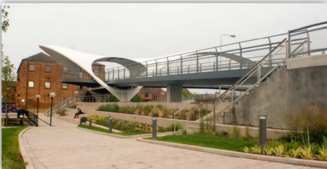
Castle Street Bridge