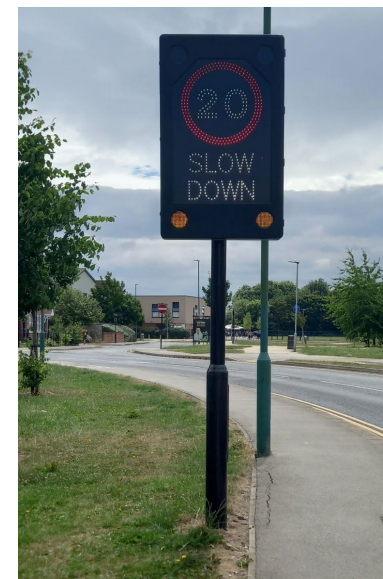
Highway Safety Signage