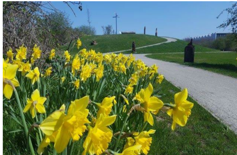
Foredyke Green at the heart of the Foredyke Area