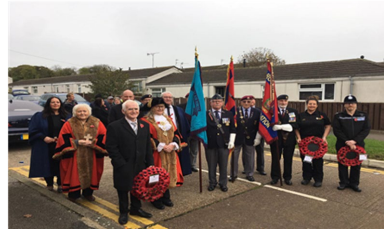
Memorial Event – November 2021