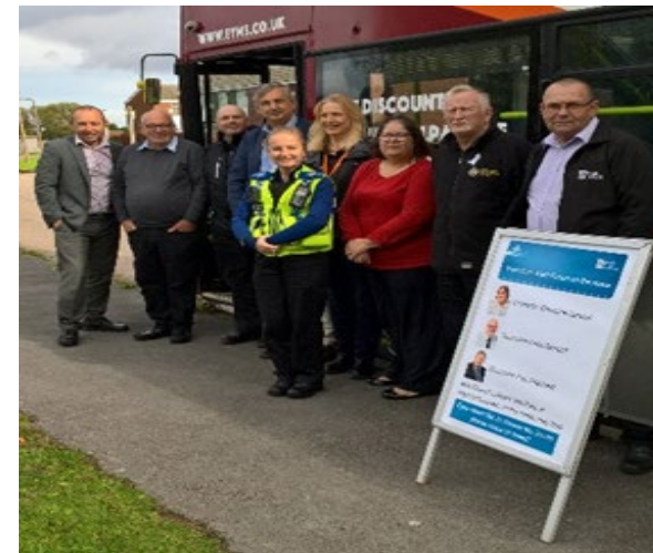
West Carr Forum on the Move Event