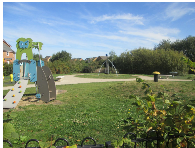
Provision of a new play area