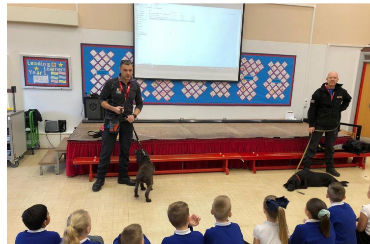
Fire Dog Presentation to School Children