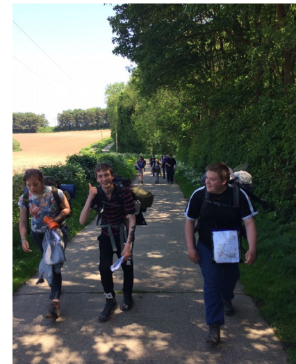
Duke of Edinburgh Participants