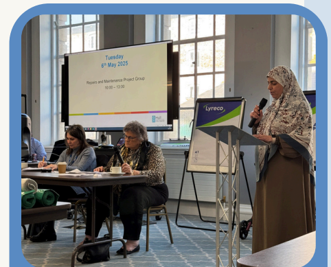
This months Tenants’ Forum

A volunteer reported that it would take 7 days to remove a sofa from the communal area of a low-rise block. Following the report, the Assistant Director for Housing changed the procedure so that all items are removed from communal areas immediately, regardless of whether it is a low, medium or high-rise block.