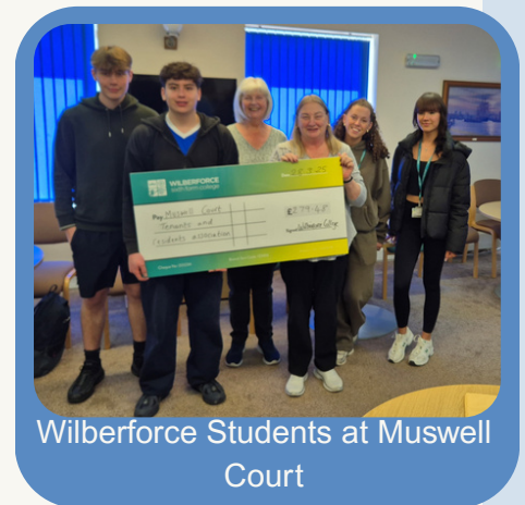
Wilberforce Students at Muswell Court

The students from Wilberforce College took part in a fundraiser called ‘Mount Muswell’ - a stair climb up and down Muswell Court. Together they raised £279.48 for the TARA, and all the money raised is going towards a Summer Garden Party happening in the summer. A huge thank you to the students that took part in this fundraiser!