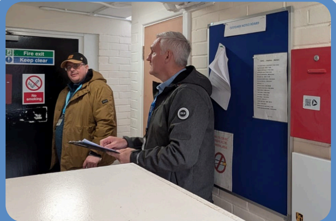
Our TP Officer taking part in flat inspections with one of our volunteers!

Please be aware dates and times are subject to change.