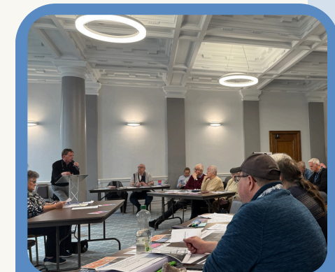
This month’s Tenants’ Forum

Don't forget to scan our QR Code at the bottom of the page to go to our social media platforms!