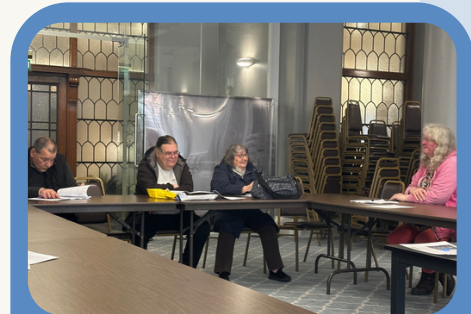
Customer Access Meeting

The Women's Voice TARA received support to develop and finalise a Safeguarding Children and Adult Policy, and they have been successful in being awarded £9460 in funding to go towards cooking, art and craft sessions, cultural events and a day trip out.