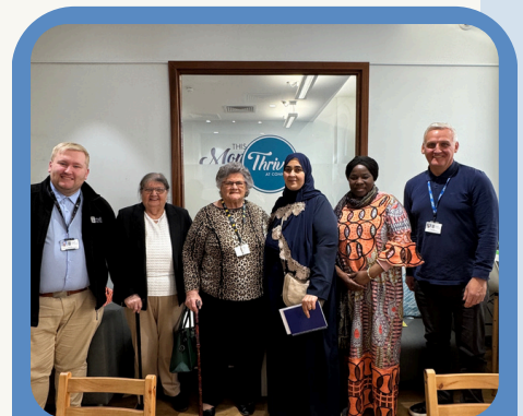
Tpas Dewsbury Event

Don’t forget to keep an eye on our social media platforms to find out about our upcoming Tenant’s Forum meetings.