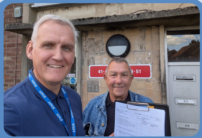
Flat Inspections at Holm Garth and Bellfield Avenue area.

Please be aware dates and times are subject to change.