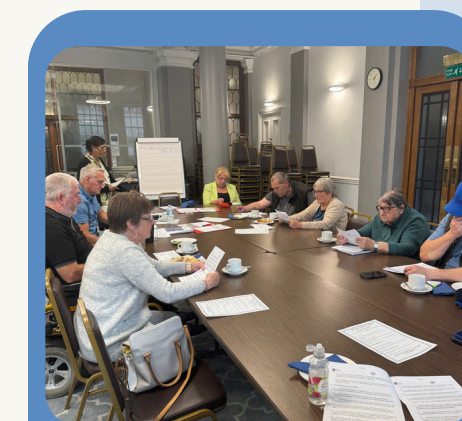
Constitution Review Meeting

Prior to the Annual General Meeting (AGM) our Tenants' Forum members met to go through the Tenants' Forum Constitution to make any suggested amendments before their AGM. The amended version will be presented to the wider Tenants' Forum at the AGM meeting, where they will vote on whether to adopt the suggested amendments into the constitution.