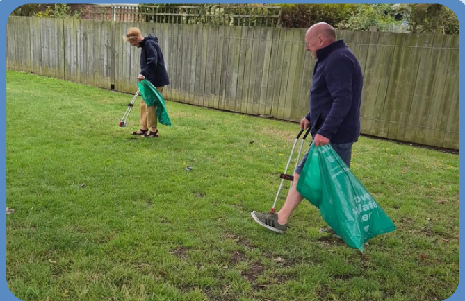
Volunteers doing a local area walk and litterpicking in the Grasby Road Area

Please be aware dates and times are subject to change.