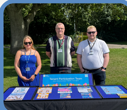
Ings Gala Event