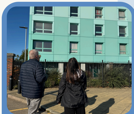
Resident Engagement Strategy visit at Padstow

Following the successful feedback received from the resident engagement surveys, the team have now started to engage with the residents of Padstow House and Gatwick House. During this month the team hand delivered the surveys in both blocks, and in mid-November the team will return to both blocks to door knock and speak to residents. These surveys are important as they help us to understand how our residents would like the Council to communicate important information about building safety and will inform the Resident Engagement Strategies being developed for each block.