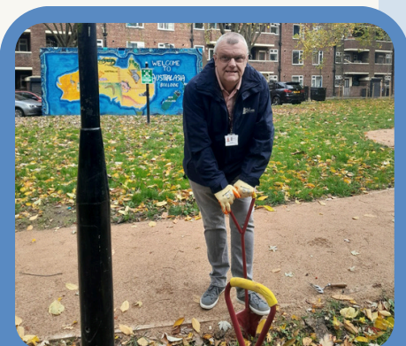
Tulip Bulb Planting at Australasia Houses