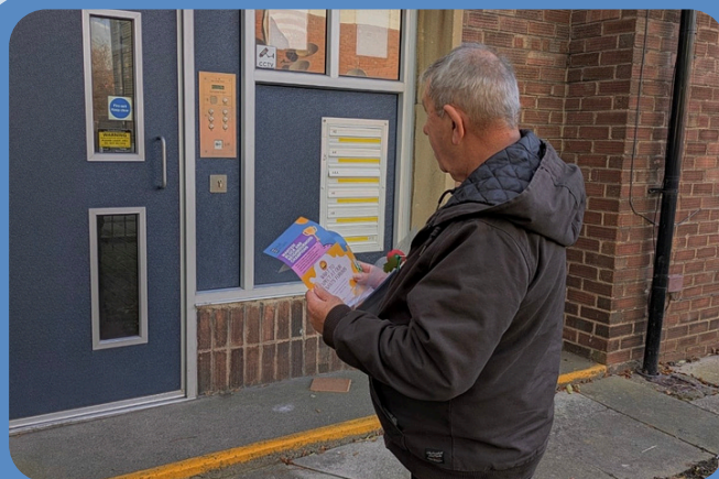
Our volunteer delivering leaflets to a block of low-rise flats

Please be aware dates and times are subject to change.