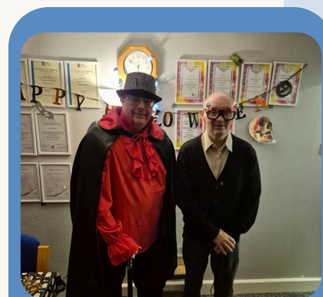
Bayswater TARA Halloween Party

If you would like more information on how to become a Block or Neighbourhood Champion and help keep your community clean and tidy, please contact the team.