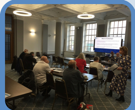
Cuckooing Training session

This month, one of our officers visited community hubs across the city to speak with residents about the engagement opportunities available. Following the positive feedback, we will now carry out weekly visits in different locations to ensure all residents are aware of the ways they can get involved.