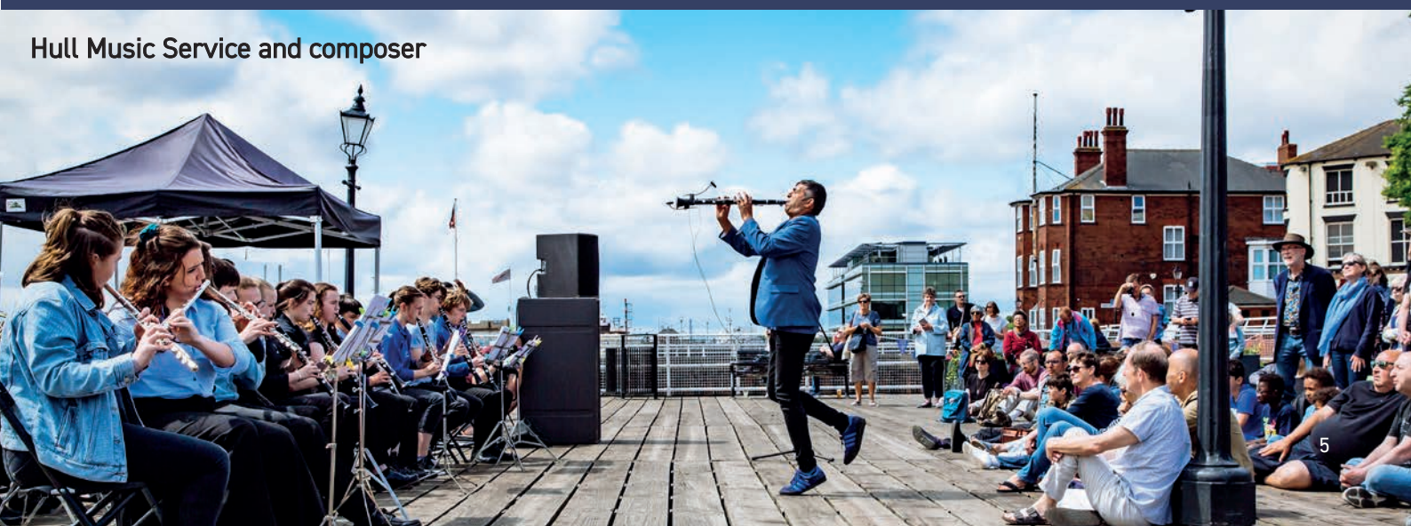
Hull Music Service and composer