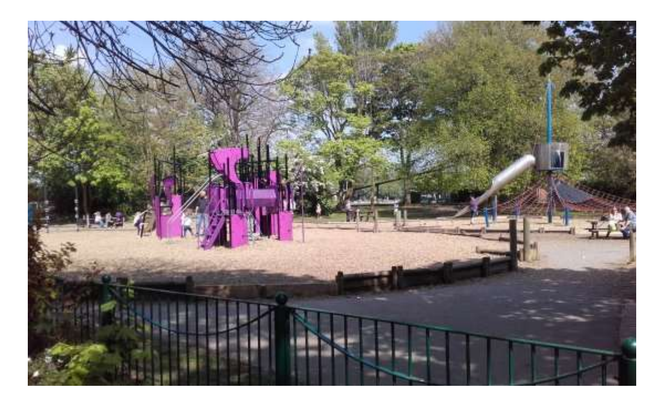
Hull City Council, December 2020